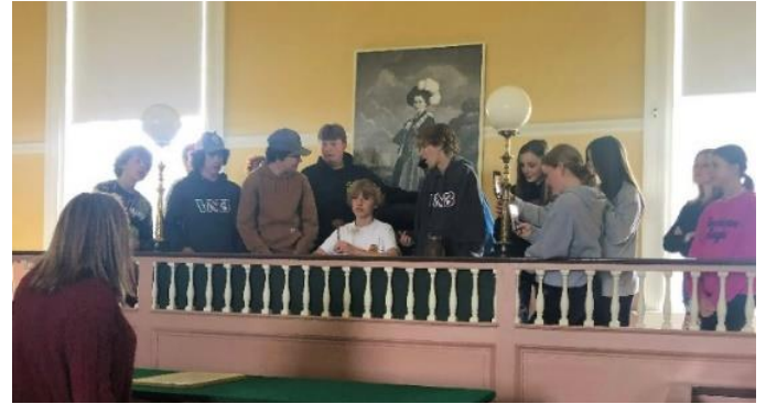
St. Stephen High School students visiting the Courthouse, May 18, 2023