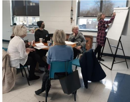
Strategic Planning Session March 21, 2022.