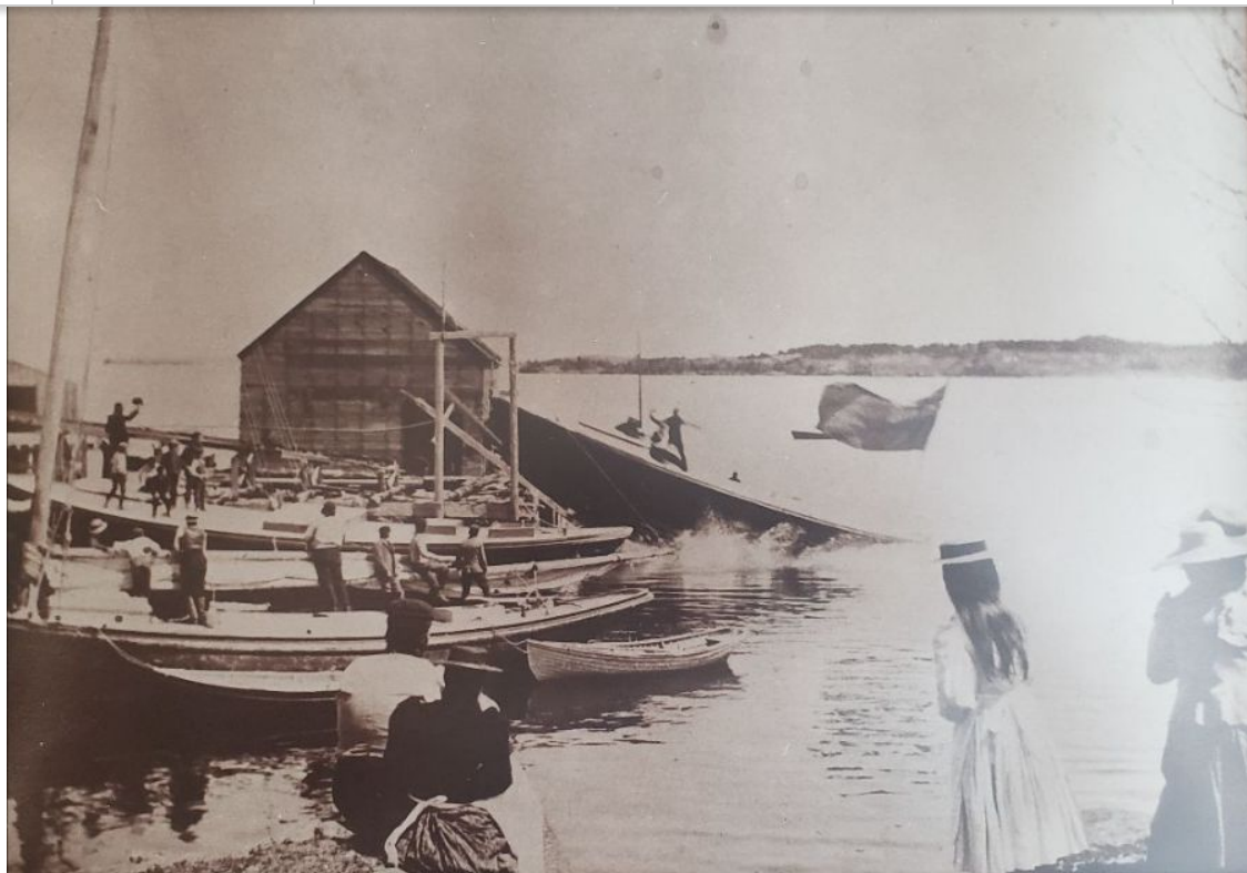
Boat launching into the water at Richardson's Boat Yard, Deer Island (P240.21)