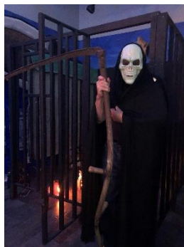
A spooky figure in the Archives' portable jail (possibly a Board member), at the Huntsman's Halloween event, October 27, 2023