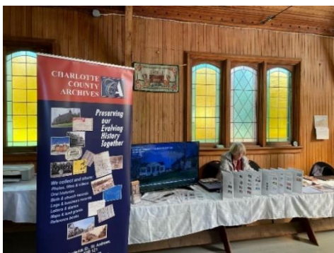
The Archives' set-up at the New Horizons for Seniors event at St. Anne's Anglican Church Hall, Welshpool, Campobello, October 10, 2023