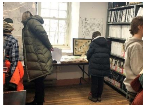
Students from Sir James Dunn Academy peruse a display of archival materials on a class visit, March 13, 2024